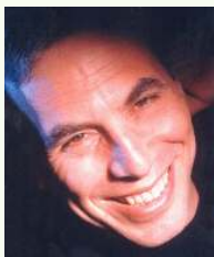
Michael J. Gelb

Michael J. Gelb , internationally renowned author, speaker, and consultant applies the principles and practices described in his best-selling books to help you solve your most important business challenges