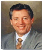
John C. Maxwell

In 1985, John Maxwell founded The INJOY Group, a collection of three distinct companies that employ 200 people and provide resources and services that help people reach their personal and leadership potential. In addition to building a successful organization, John has authored more than thirty books, including the New York Times best sellers The 21 Irrefutable Laws of Leadership and Failing Forward .